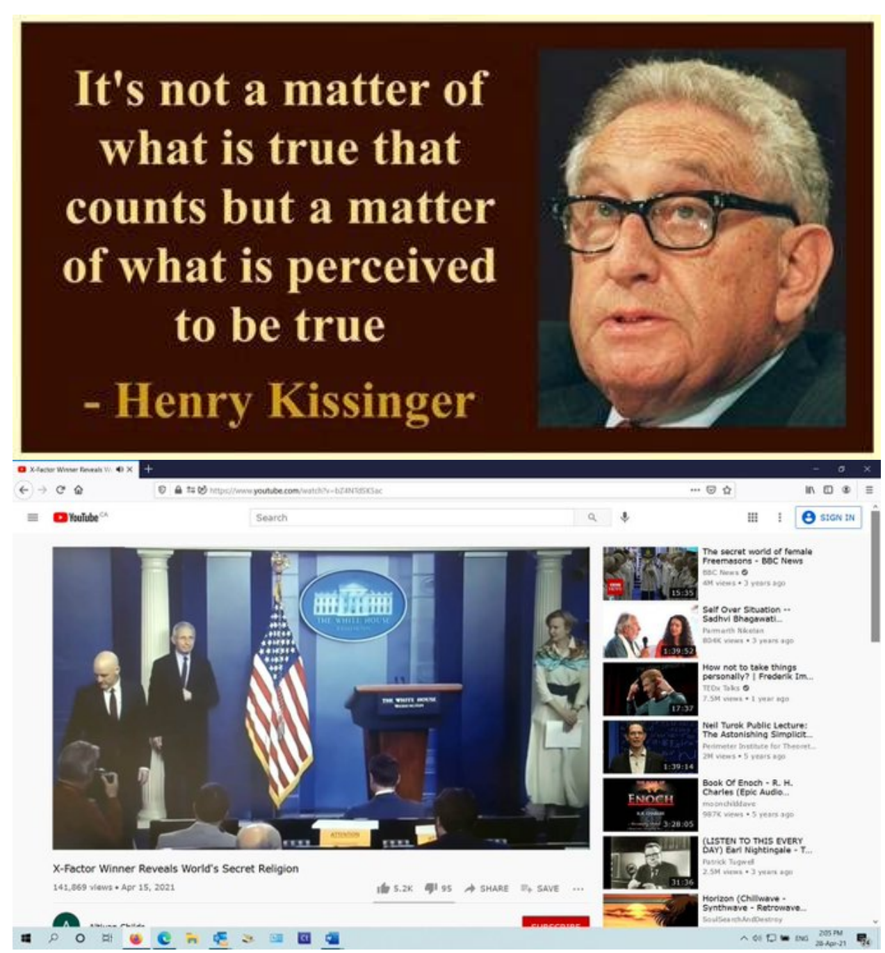
Treasonous Traitor Fauci giving the Hidden Hand Sign (hand in jacket) of Freemasonry