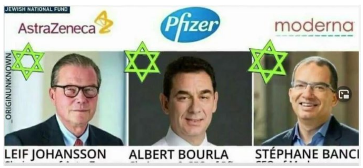
Who makes the "vaccines" to KILL YOU? All Jews!

The College is aware and concerned about the increase of misinformation circulating on social media and other platforms regarding physicians who are publicly contradicting public health orders and recommendations. Physicians hold a unique position of trust with the public and have a professional responsibility to not communicate anti-vaccine, anti-masking, anti-distancing and anti-lockdown statements and/or promoting unsupported, unproven treatments for COVID-19. Physicians must not make comments or provide advice that encourages the public to act contrary to public health orders and recommendations. Physicians who put the public at risk may face an investigation by the CPSO and disciplinary action, when warranted. When offering opinions, physicians must be guided by the law, regulatory standards, and the code of ethics and professional conduct. The information shared must not be misleading or deceptive and must be supported by available evidence and science.